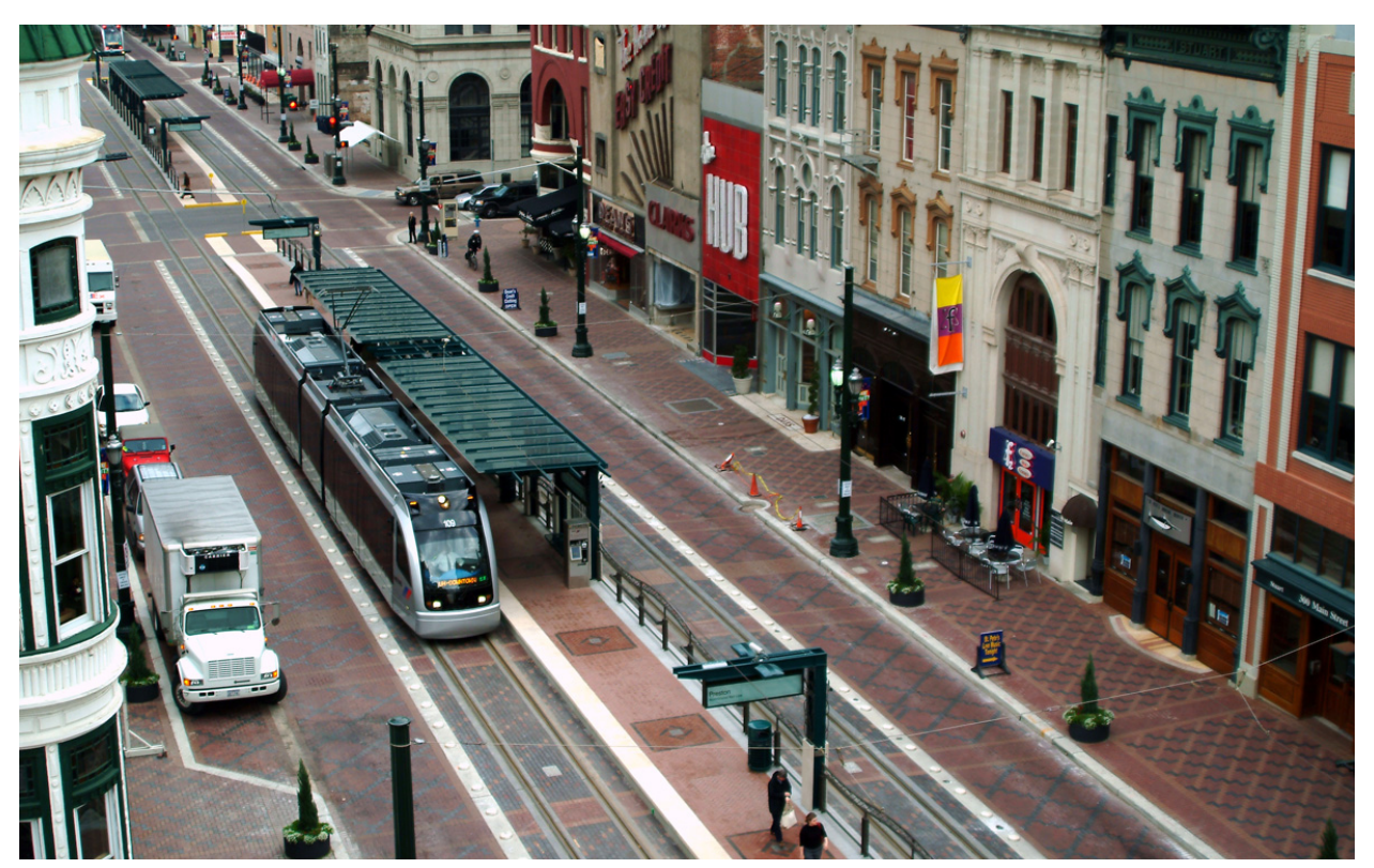
LRT in Houston, Texas

I am encouraged to see support for rapid transit in Hamilton, whether it is LRT or BRT. However, assertions that the two options are radically different from one another are not accurate. The B-Line as we know it today is not BRT, it is an express bus, and it is 'express' because it skips some stops. In contrast, BRT – like LRT – is designed to run in a separate right-of-way with full stations at similar spacing and signal priority at intersections. These features are what enable the 'Rapid' in Bus Rapid Transit, just like LRT. And like LRT, investments in BRT work best when the same supportive plans and policies are in place. So aside from trains on tracks or buses on concrete or pavement the two modal options are fairly similar in terms of operation and potential construction disruption.<sup>2</sup> No matter which is chosen, there is still $80 million worth of underground infrastructure that will need to be replaced over the coming years, and the funded LRT project covers that cost.